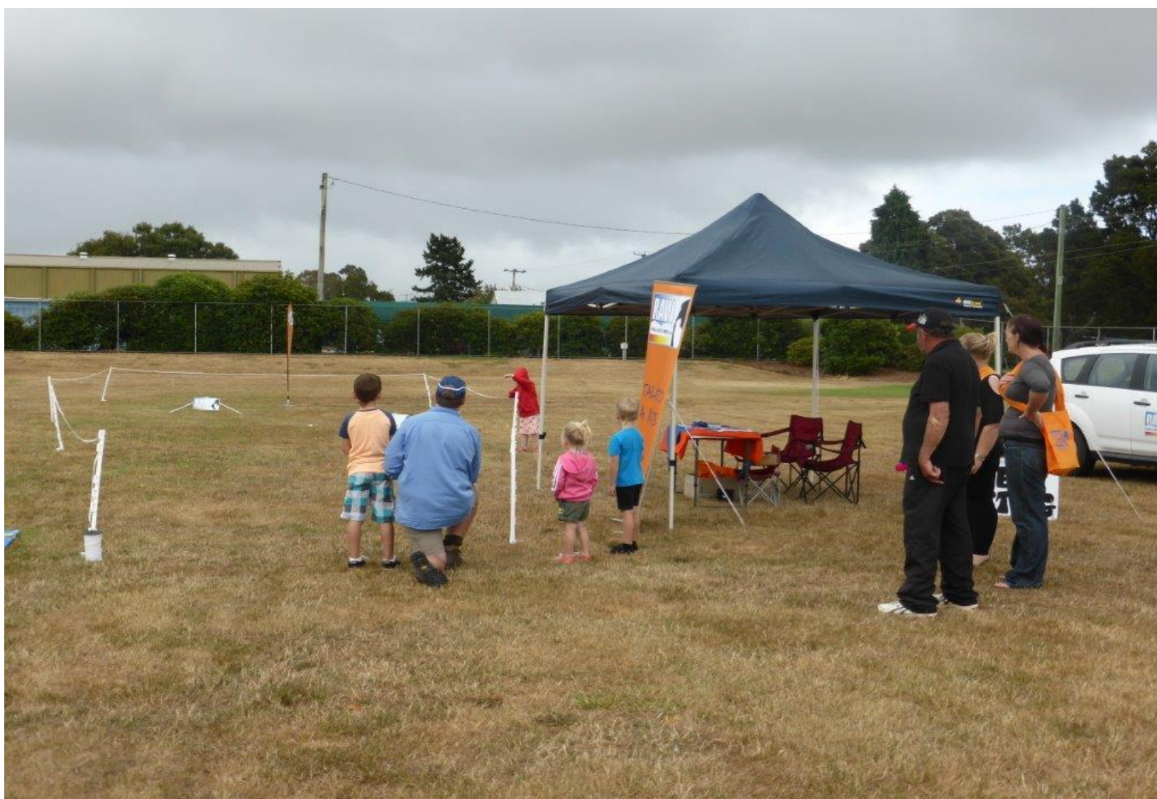
King Island Show