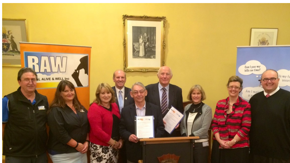
MOU Signed between Rural Alive and Well and Rural Business Tasmania